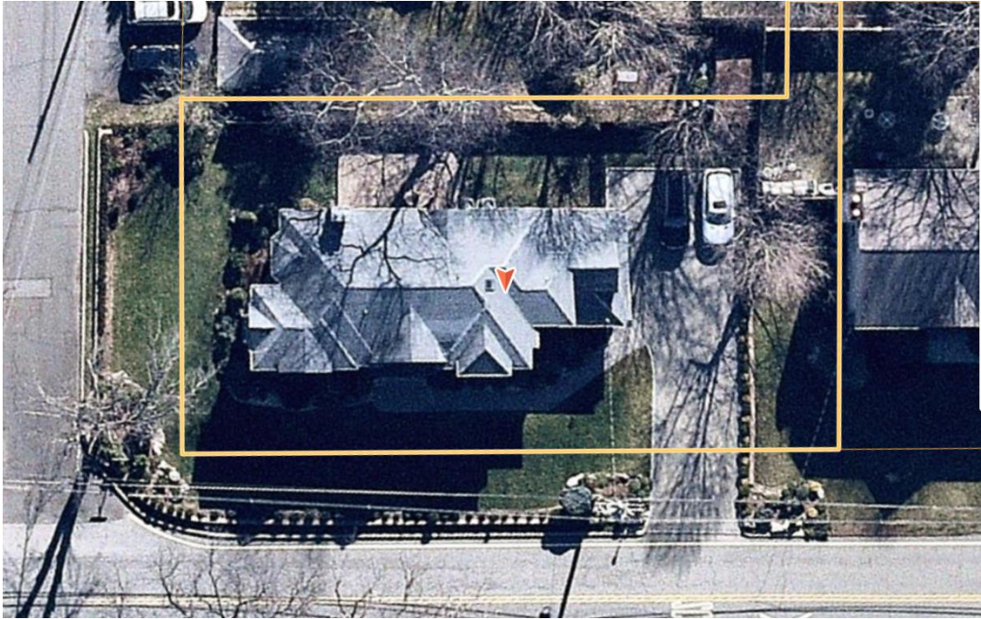
Historical Imagery – Conditions from 2014 - 2017