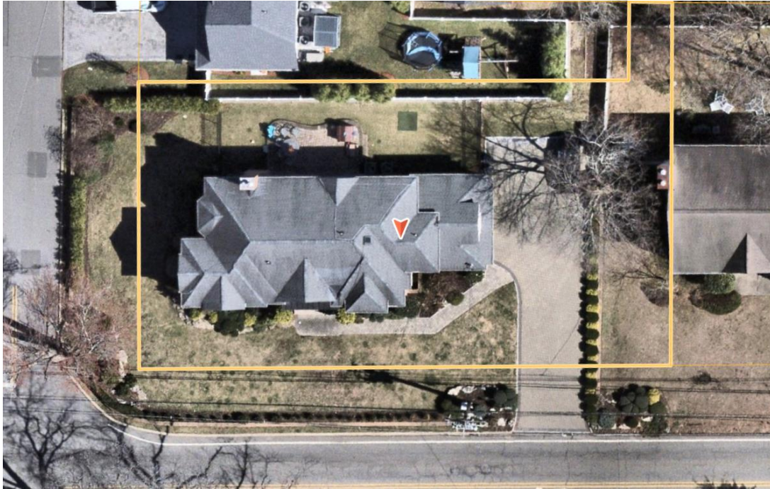
Historical Imagery – Conditions from 2024 – Current

Should you have any questions, you may contact me at (201) 775-1283.