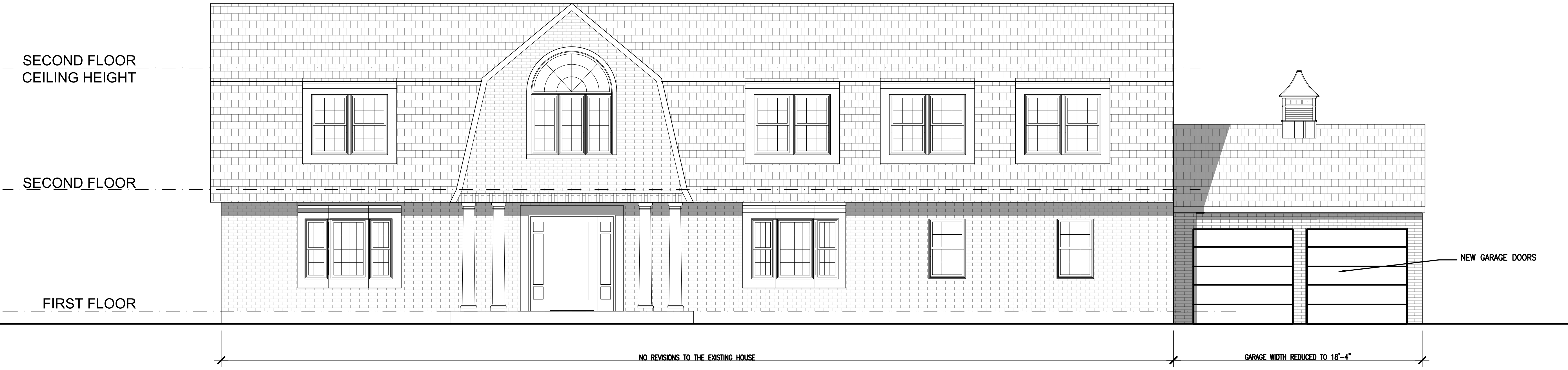
1 A-1 PROPOSED FRONT (EAST) ELEVATION SCALE: 1/4" = 1'-0"

© COPYRIGHT - This drawing is the property of Axis Architectural Group, LLC. 2018. It is subject to copyright law & shall not be used or copied without express written permission.