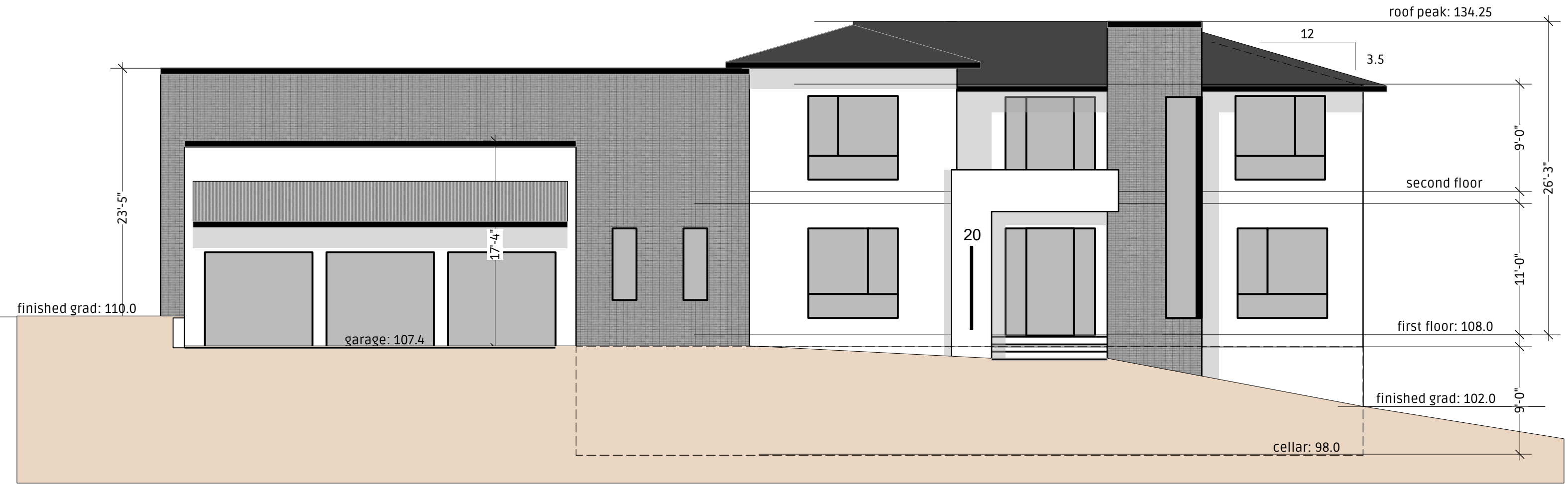
Street Elevation scale: 1/8" : 1'-0"